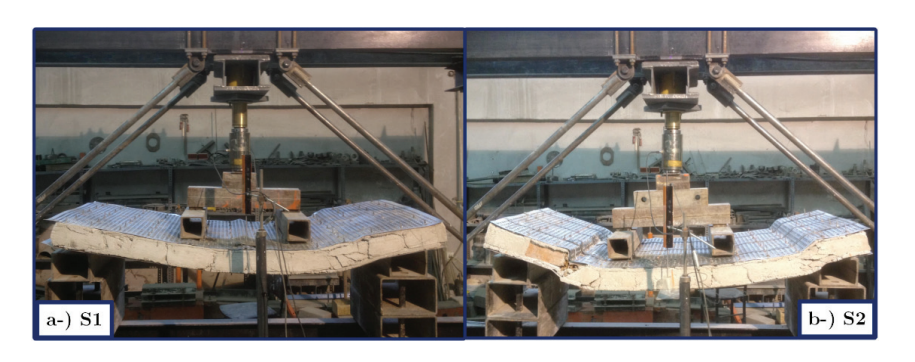
Figure 4. Failure modes of the specimens