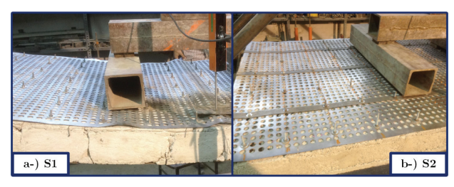
Figure 1. Test specimens

The specimens were composed of 85x190x190 mm hollow bricks, whose horizontal channels were oriented parallel to the width of the wall. The compressive strength values of the bricks parallel to the channels and perpendicular to the channels in the short and long directions were measured as 12.0 MPa, 2.8 MPa and 3.2 MPa, respectively. The overall thickness of the unstrengthened wall, including the brick and the plaster layers on both faces, was 150 mm. A mortar mixture with a measured compressive strength of 12.3 MPa was used as the binder between the bricks and as the plaster on the faces of the wall. The perforated steel plates had a thickness of 1 mm. Each plate perforation had a diameter of 16 mm and a clear spacing of 8 mm from the neighboring perforations along the length and width of the plate. The steel plates and strips had a measured yield strength of 280 MPa. The plates and strips were connected to the wall to each other with the help of M6 anchor bolts, which were post-tensioned with a torque of 3 N.m. This torque value was chosen in a way that the largest post-tensioning forces possible (50% of the axial bolt capacity) could be applied to the wall without causing the failure of the bolts due to the additional stresses in the bolts induced by the out-of-plane bending moments. The bolts were spaced at 150 mm on center along both the width and height of the wall.