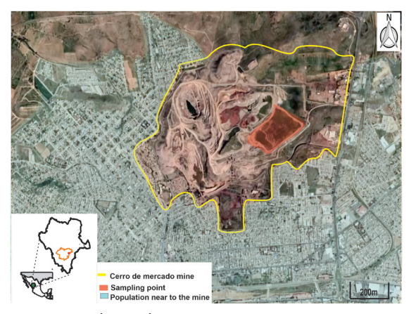
Figure 1. Study area location

The sampling carried out at the tailings in the water dam "Boleo Estrella", were conducted in accordance with the standard NMX-AA-132-SCFI-2016, (Official Journal of the Federation, 2017). The samples were then analyzed using the US-EPA 6200 method, an "X-Ray