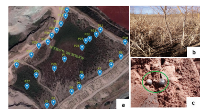
Figure 4. a) Sampling points on tailings dam, b) vegetation present in dam, c) insects found during sampling

tailings. Samples were taken in a rectangular pattern, at a depth of 30 cm, obtaining 27 samples (Figure 4a). During sampling, extensive vegetation was observed as well as various insects (Figures 4b, 4c). The quantity of tailings taken at each point was approximately 4 kg, which were placed in airtight polyethylene bags for further analysis.