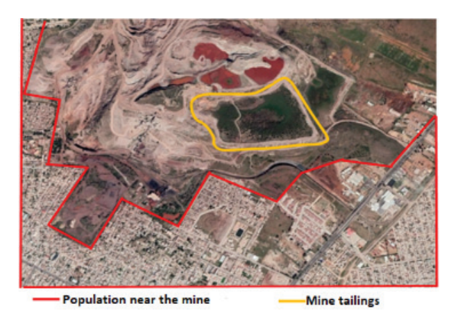
Figure 7. Population living nearby tailings dam

nat, 2009), (EPA, 2016) it is observed that the HI values do not exceed the CRT values so, according to EPA, (1989) and Fowle & Dearfield (2000) adverse effects on the health of the population are not likely to be observed due to contact and inhalation of tailings from the "Cerro de Mercado" mine. On the other hand, arsenic is recorded by SADA as a substance with the ability to generate carcinogenic and non-carcinogenic effects on health, the calculations for carcinogenic effects are shown in Table 5.